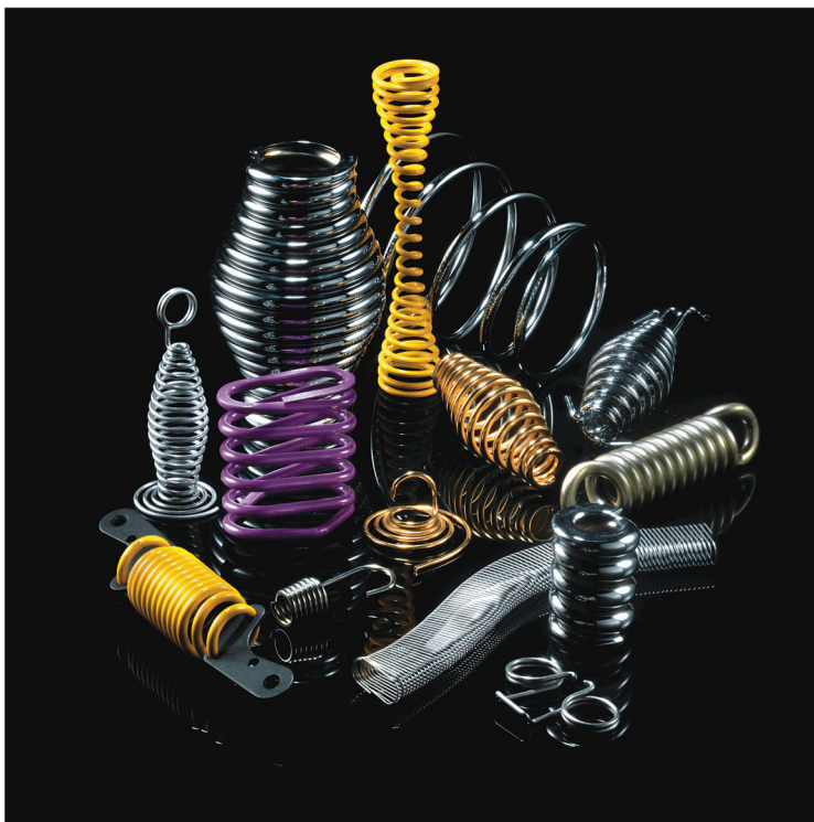
Types of spring and wire formed products manufactured by Ace Wire Spring & Form.

Tolerance is the key to Ace Wire Spring & Form's unique advantage, and it is essential to understand what specific tolerance is required to meet the customer's application. Standard tolerance springs are accurate to a wider margin of specifications than custom springs. These springs are acceptable for noncritical